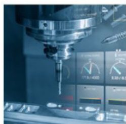
Understanding the different Data Sources

A subscription to the E-Learning platform will provide customers unlimited access for 12 months to an online portal of topic-based training videos. Each course is structured with multiple video lessons. Quizzes at the end of each course ensure that the most important pieces of information were captured.