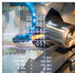
Modifying Existing Machine Data