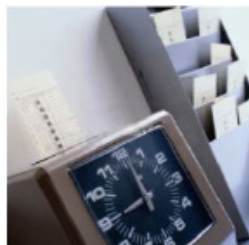
Configuring Shift Options