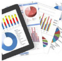
Configuring Reporting Options

Scytec provides online courses to learn how to fully utilize DataXchange machine monitoring features. From data reporting options, to installation, to modifying existing data, and beyond, E-Learning insures you get the most of DataXchange!